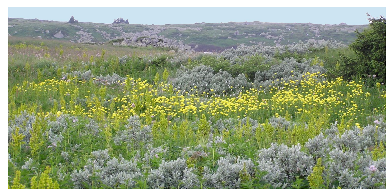
■ Vitosha Nature Park, Bulgaria. A Natura 2000 site, sub-alpine willow communities.

Addressing these bottlenecks will require rethinking the design of funds and changing behaviour through learning and increased knowledge at all levels as a prerequisite for political will and initiative. The difficulty lies in the number of levels at which these changes must be made, ranging from non-governmental organisations to top decision makers at national and EU levels. Without sufficient awareness and comprehension by leaders like elected politicians, systematic change will not be achieved. In the context of the successive economic shocks caused by the pandemic, inflation and the limited availability of raw materials, a rational rethink of existing biodiversity financing processes is very ambitious but thoroughly necessary. The following recommendations aim to advance the discussion and initiate a problem-solving process.