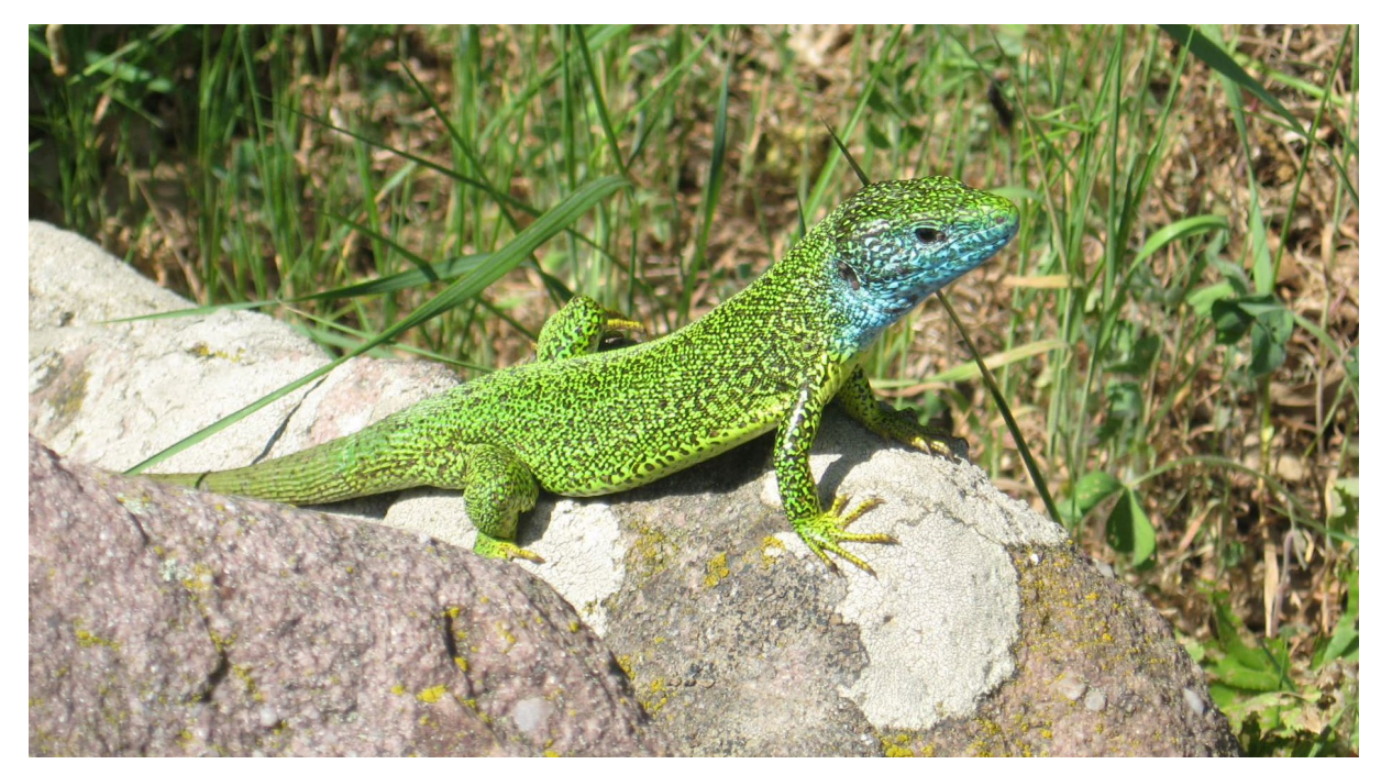
A European green lizard in Vrachanski Balkan nature park, a Natura 2000 site in Bulgaria.

Across the four roundtables, similar if not identical types of bottlenecks were identified by participating stakeholders and decision makers.