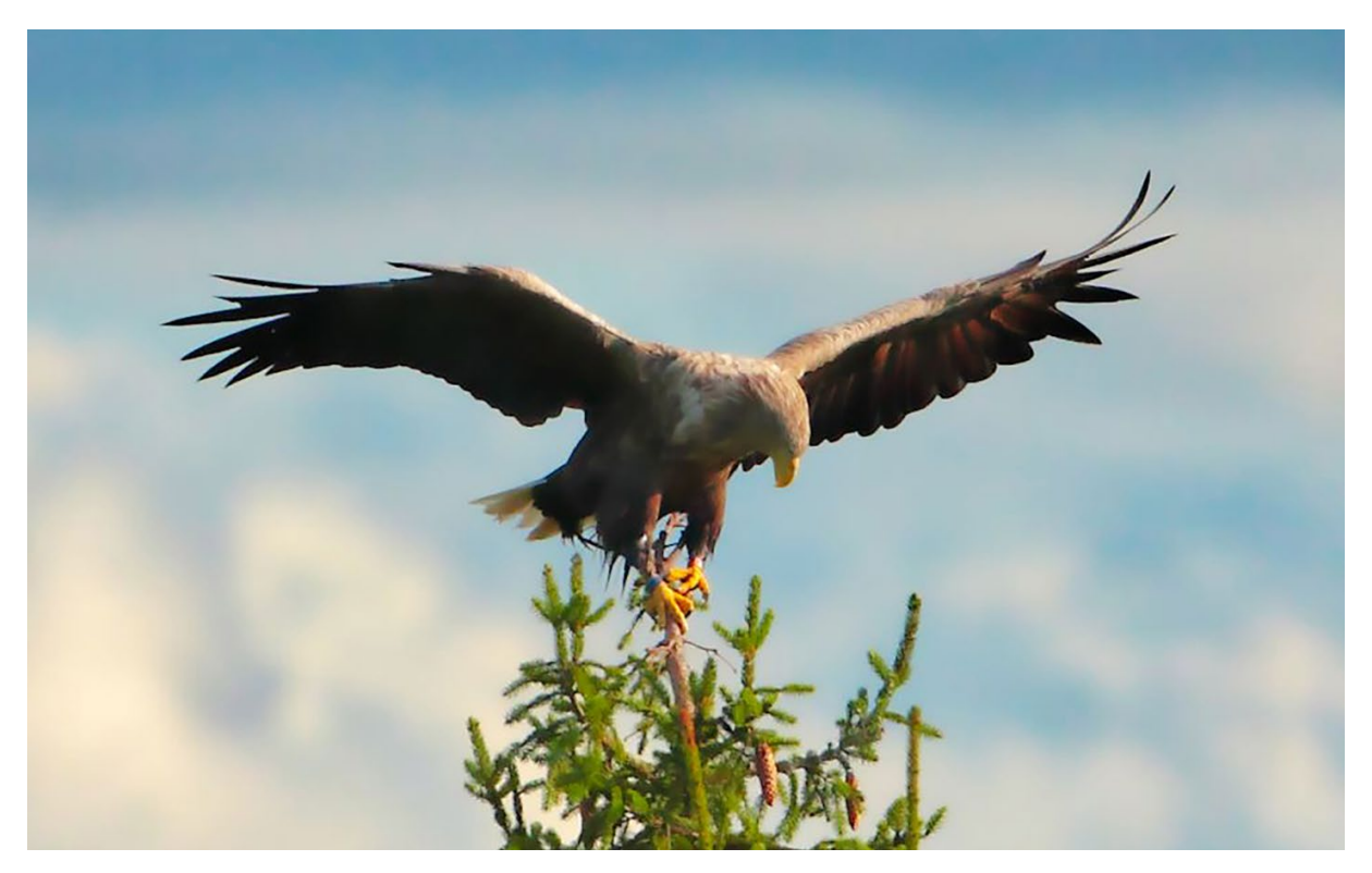
White-tailed eagle, Kemeri National Park, Latvia. There are 93 bird species of EU importance in Latvia. Their biggest threat is loss of habitat.

This report is based upon an initiative whose main purpose was to establish a dialogue in the form of roundtables, which would for the first time comprehensively address the issue of national biodiversity financing. This is crucial for establishing a common understanding of the challenges, advantages and issues faced, leading to the identification of bottlenecks and future actions for solutions.