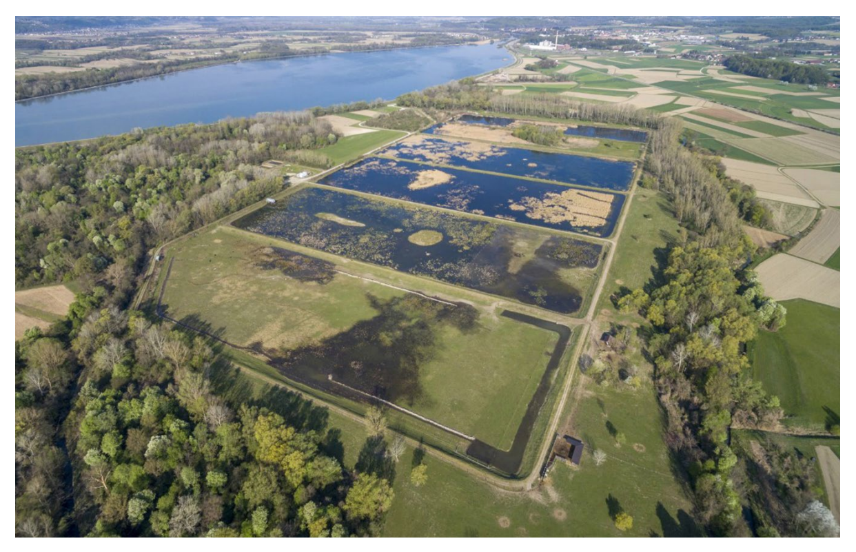
Ormož Basins Nature Reserve, Slovenia: a 55-hectare wetland of exceptional national and international significance for many endangered bird species.

In Bulgaria and Latvia, for instance, while there are some monitoring programmes for biodiversity, the results of implementing agricultural measures and their impact on biodiversity are not studied. The lack of monitoring and/or analysis of the results of environmental programmes led by national authorities also leads to a lack of transparency. It is often unclear whether and to what extent projects have been successful in achieving their intended objectives, and this in turn is a missed opportunity for educating other stakeholders on the importance of such projects.