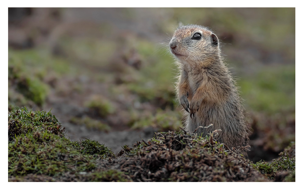
European souslik.